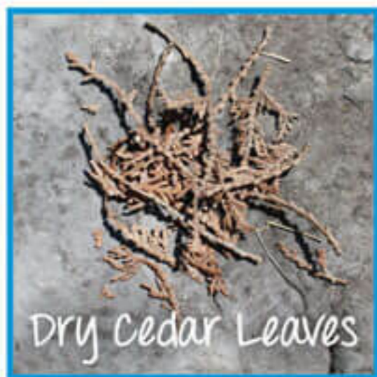
Dry Cedar Leaves